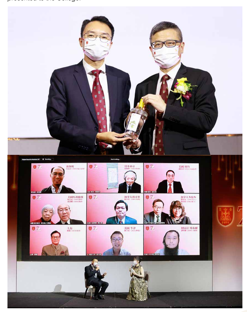
海外及內地校友透過 Zoom 與席上嘉賓互動,並向學院送上生日祝福。 Overseas and Mainland alumni interacted with the guests at the banquet and delivered greetings to the College.

Chung Chi College Alumni Association and Two Moons, the first local Gin Distillery, introduced "CC70" Anniversary Gin". The bottle with serial no. 001 was presented to the College.