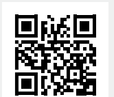
網上捐款 Online Donation

Now donate to the "Student Development Fund", "EYE Award" or "FLY Award". The College will be empowered to organise and subsidise more summer activities for students to unleash their potential and enrich their life experience!