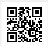
E 計劃專輯 Project E Special