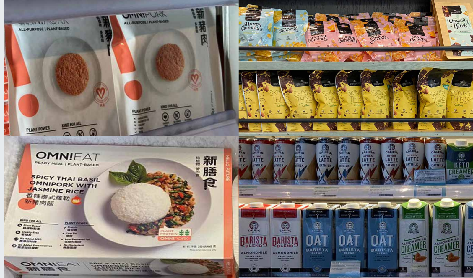
研究團隊到訪 Green Common 分店進行實地考察，親身認識香港素食產品：（由左至右、上至下）素肉（新豬肉）、素零食（素軟糖和素巧克力）、微波爐素食（新豬肉飯）及素飲品（燕麥奶和米奶）。

The research team conducted a field study at a branch of Green Common and got to know some vegetarian products in Hong Kong: (from left to right, top to bottom) vegan meat (plant-based pork), vegan snacks (vegan gummies and chocolate), vegan microwave food (plant-based pork with rice), and vegan beverages (vegan oat milk and rice milk).